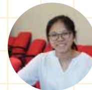
迦密中學 Carmel Secondary School

在公司實習的時光更讓我畢生難忘。我從來沒想到，一個中學畢業生能在一間世界前五十強的保險公司實習，我們對保險一竅不通，業務的專業名詞很多都不會，然而旁邊的同事抽出他的時間，一一細心指導我們。