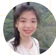
香港培道中學 Pooi To Middle School

在這一個半月的實習交流活動中，我最大的收穫莫過於人際網絡的拓寬。此旅程不但讓我認識到來自不同學校的香港夥伴，更認識到不少內地同事，大大拓寬我的社交圈子，讓我的朋友圈不止局限於自己學校，更延伸至其他學校，甚至內地。