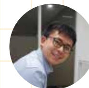
聖士提反書院 St Stephen's College

我在這次實習計劃學習到的東西非常實用，親身感受財務報表錄製過程，替客戶進行定期檢查，完整協助進行分析，這樣的經驗並不是隨便能夠得到的。我對本計劃及實習安排也非常滿意，真的令我獲益良多。